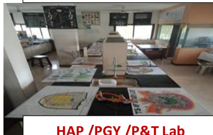
HAP /PGY /P&T Lab